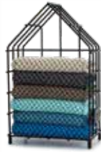
COUNTER CLOTHS AND BOX SET